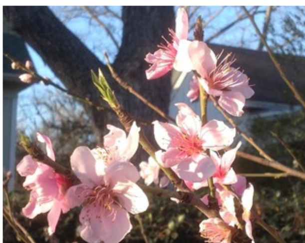
"Peach Blossoms"

We've been blogging regularly about the creative process, creativity and education, and the power of storytelling and narrative. Our latest blog post, " The Creative Pause " explores the value of quietude and stillness in the creative process. Click here for the blog.